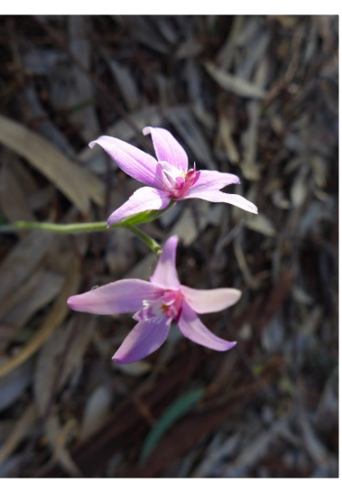
Photos taken in Rossmoyne Park