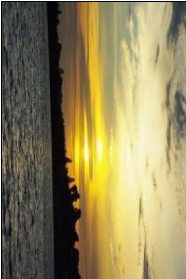
View of Canning River from the Shelley Sailing Club

Representing residents' interests in Riverton, Rossmoyne and Shelley since 1984.